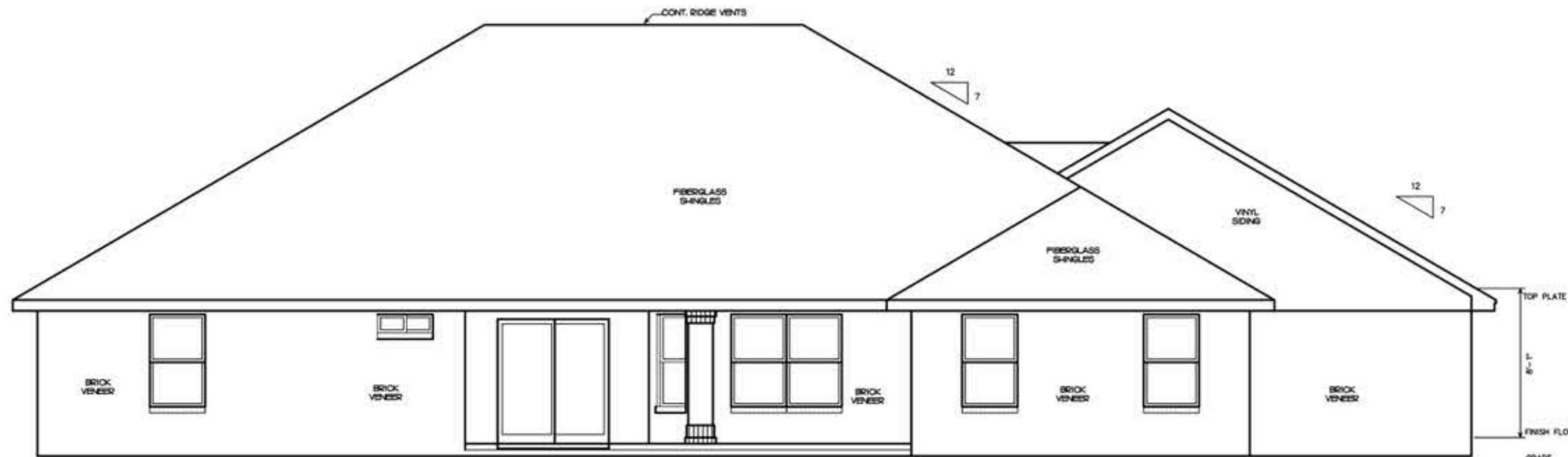
REAR ELEVATION SCALE 1/4" = 1'-0"